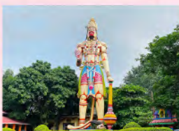
Hanuman Vatika: A beautiful temple complex with a 75-foot statue of Lord Hanuman, a serene place for spiritual visitors.