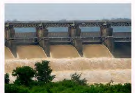
Mandira Dam: It is located near 20 KMs from Rourkela. It is built across Sankh river, near Kansbahal, located 16 km upstream from Mandira.