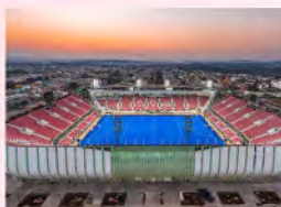
Birsamunda Hockey Stadium: India's largest hockey stadium, a must-visit for sports enthusiasts.