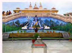
Trishakti Dham: It stands as a beacon of spirituality, attracting devotees with its serene atmosphere and stunning architecture.