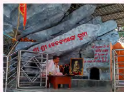
Vedvyas Temple: A sacred Hindu site at the confluence of three rivers, believed to be the birthplace of Maharishi Vedvyas, the author of the Mahabharata.